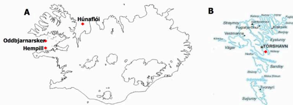
Figure 1. The sample sites. A) Iceland B) The Faroe Islands. Stations are marked with a red diamond.

A subtidal gastropod, the common or waved whelk Buccinum undatum is widely distributed in the North Atlantic as well as the Greenland and Norwegian seas [1]. The morphology of the common whelk, both in appearance and shell ratios, is variable between countries and areas. Distinct morphological differences in whelks have been observed between areas in Breiðafjörður in the current study. The varying morphology indicates that migration of whelks between areas might be limited enough to form genetically distinct subpopulations. The aim of this study is to test the hypothesis that there are different populations of the common whelk in Iceland and the Faroe Islands as well as between areas within Iceland.