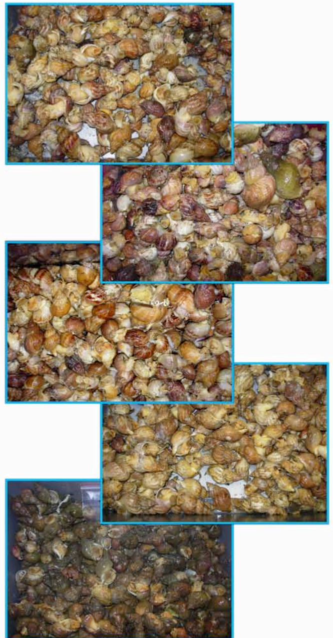
Figure 2. The morphology of whelks in Breiðafjörður. Pictures of whelks from Elliðaey, Hempill, Oddbjarnarsker, Prestaflaga and Brjánslækur (from top to bottom).